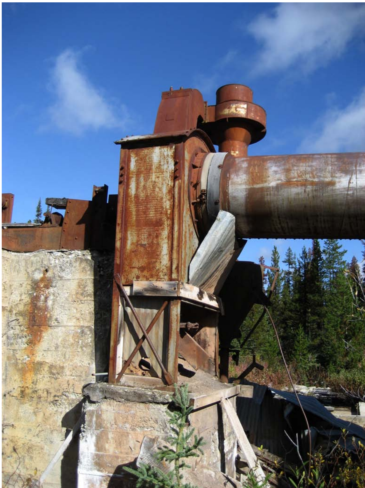
The abandoned Bralorne-Takla Mine, which dates to World War II, still has rusted equipment that was used in mercury mining operations.