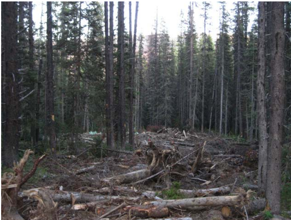
This spur leads to one of seventy drill pads at the Kwanika exploration site. Exploration requires clearing swaths of forest and disturbs the wildlife in the area. Reclamation will consist of covering the cut logs with grass seed.