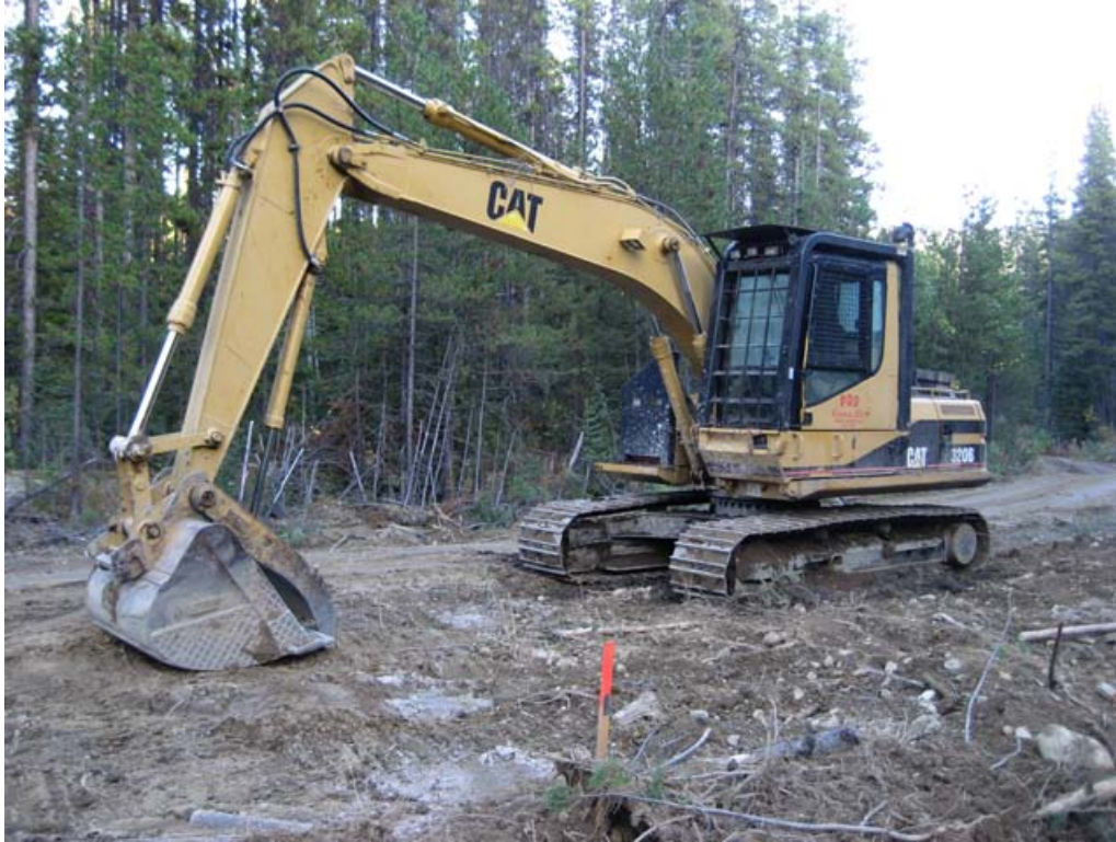
A backhoe used at the Kwanika exploration site stands on a road that has been cut through the forest to allow drilling equipment to pass.