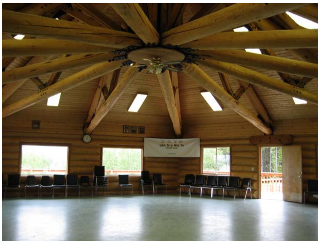
Takla's potlatch house is the center of the community's traditional governance system. It is used for meetings of keyoh holders and other local gatherings.